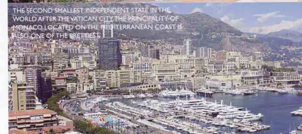
THE SECOND SMALLEST, INDEPENDENT STATE IN THE WORLD AFTER THE VATICAN CITY, THE PRINCIPALITY OF MONACO LOCATED ON THE MEDITERRANEAN COAST IS ALSO ONE OF THE BEST