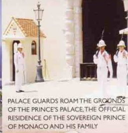
PALACE GUARDS ROAM THE GROUNDS OF THE PRINCE'S PALACE, THE OFFICIAL RESIDENCE OF THE SOVEREIGN PRINCE OF MONACO AND HIS FAMILY