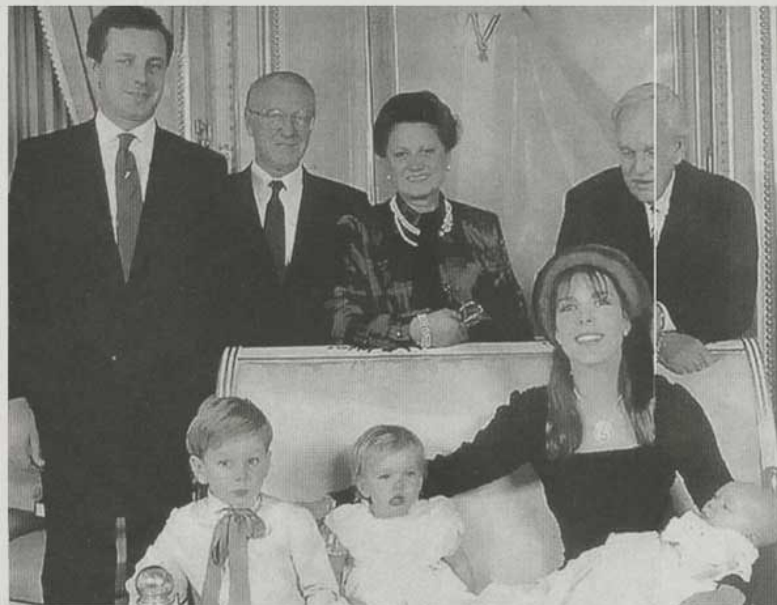
Andrea, eldest of Princess Caroline's three children, sits with his mother and siblings Charlotte and baby Pierre. Behind the couch are his father Stefano and grandparents, including the late Prince Rainier III of Monaco (extreme right).